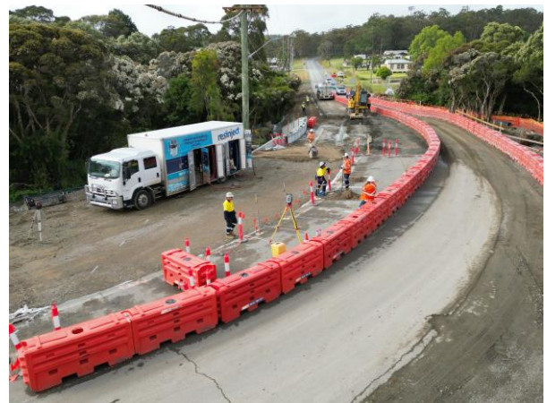
Figure 2. The Resinject team working to consolidate the weak ground surrounding the bridge

The council set about inspecting the site with the aim of widening the bridge and upgrading the structure from timber to concrete. On inspection, it was identified that the ground surrounding the bridge including the underlying creek bed was weak and poorly compacted.