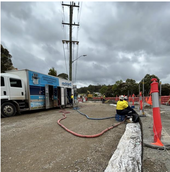
Figure 3. In-ground injection treatment

Resinject's primary injected Resin product, labelled as " RSJ170 ", fully complies with the Roads & Maritime Services M232 Quality Assurance Specification for Injected Expanding Resin Slab Jacking / Stabilisation, and is engineered to lift over ninety (90) tonnes per square metre area.